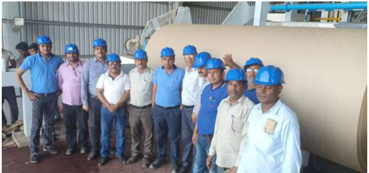
(Paper Reel – Unit-1, PM-2)