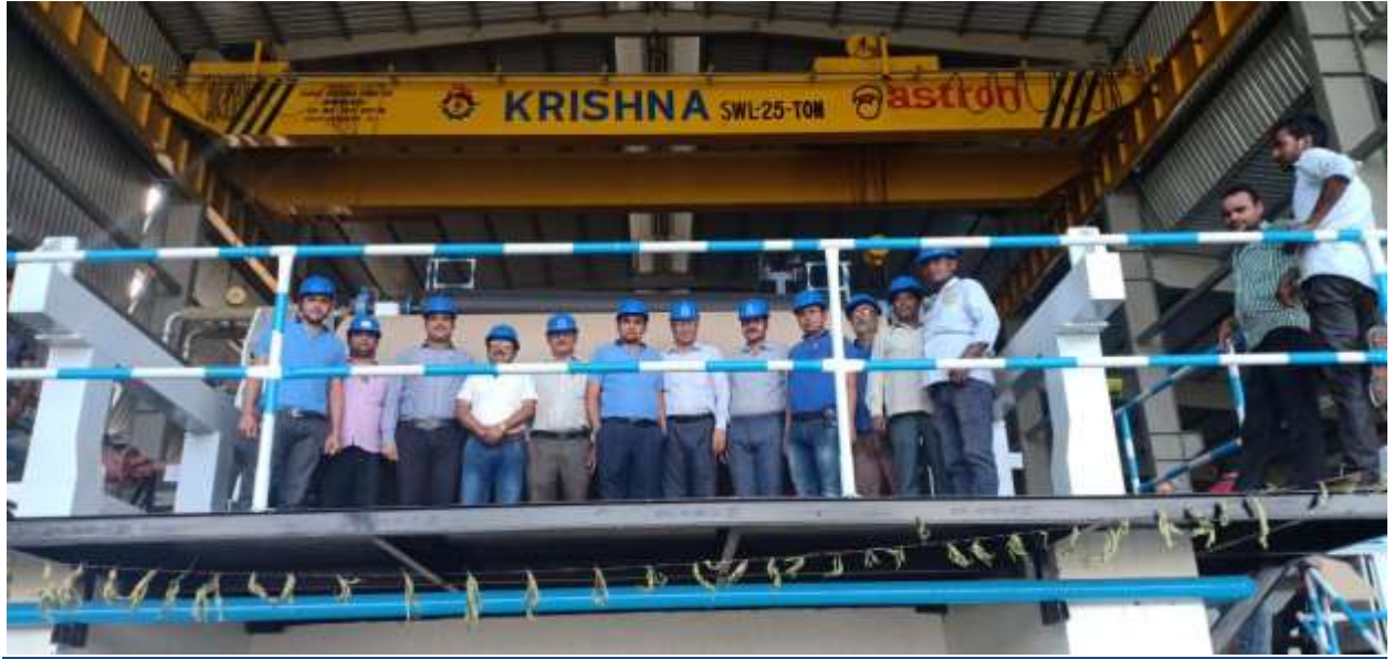
(Paper Machine Unit-1, PM-2 – Capacity 33000 MT/Year.)